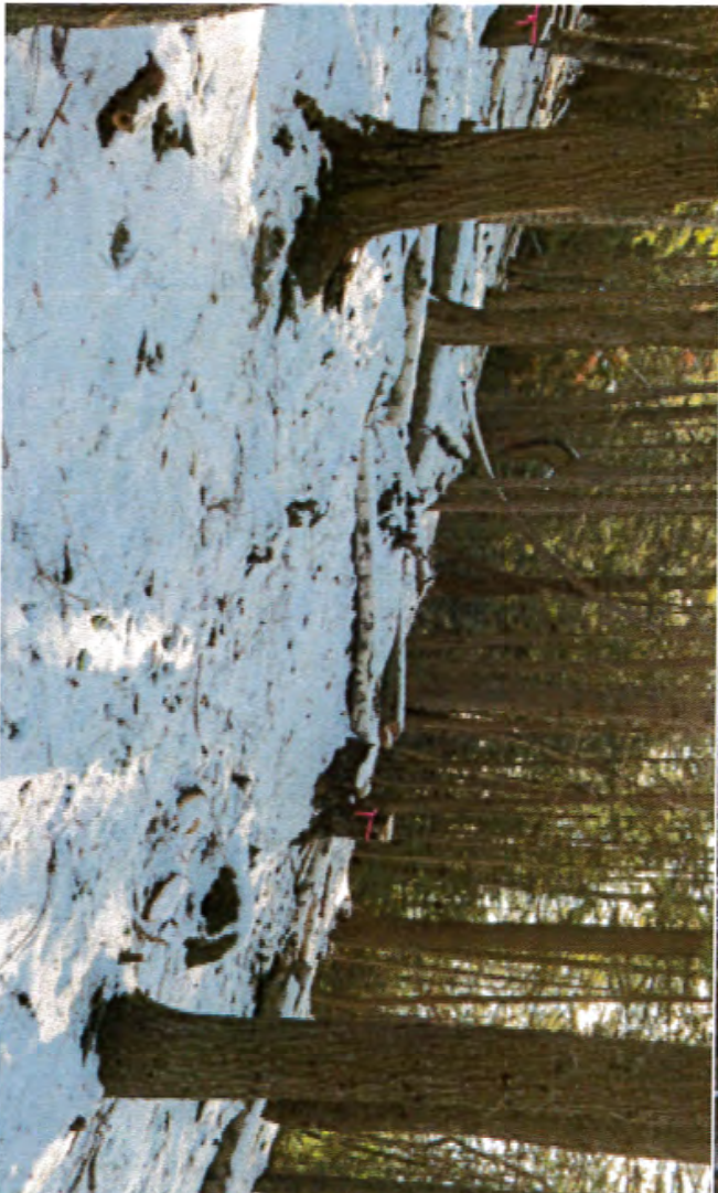
Before / After Permanent Sample Plot #1 – South view