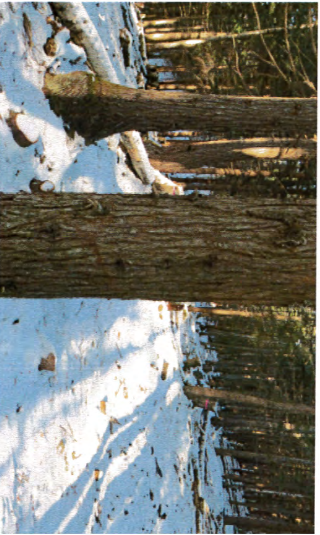
Before / After Permanent Sample Plot #1 – North view